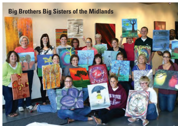
Big Brothers Big Sisters of the Midlands