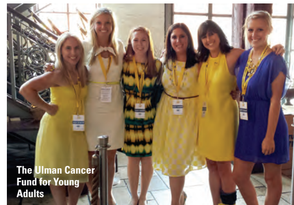
The Ulman Cancer Fund for Young Adults