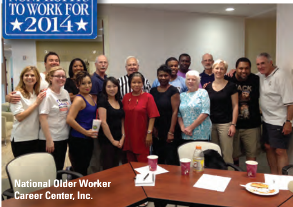
National Older Worker Career Center, Inc.